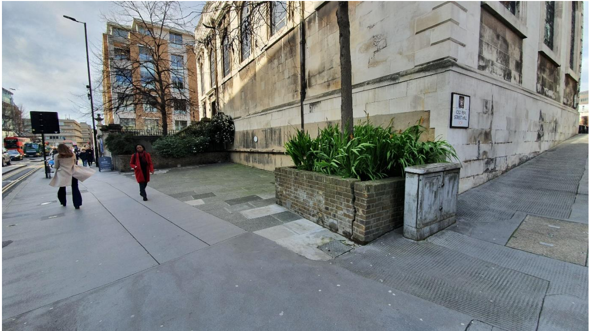
Phase 3 | Site adjacent to St Nicholas Cole Abbey Church - Existing