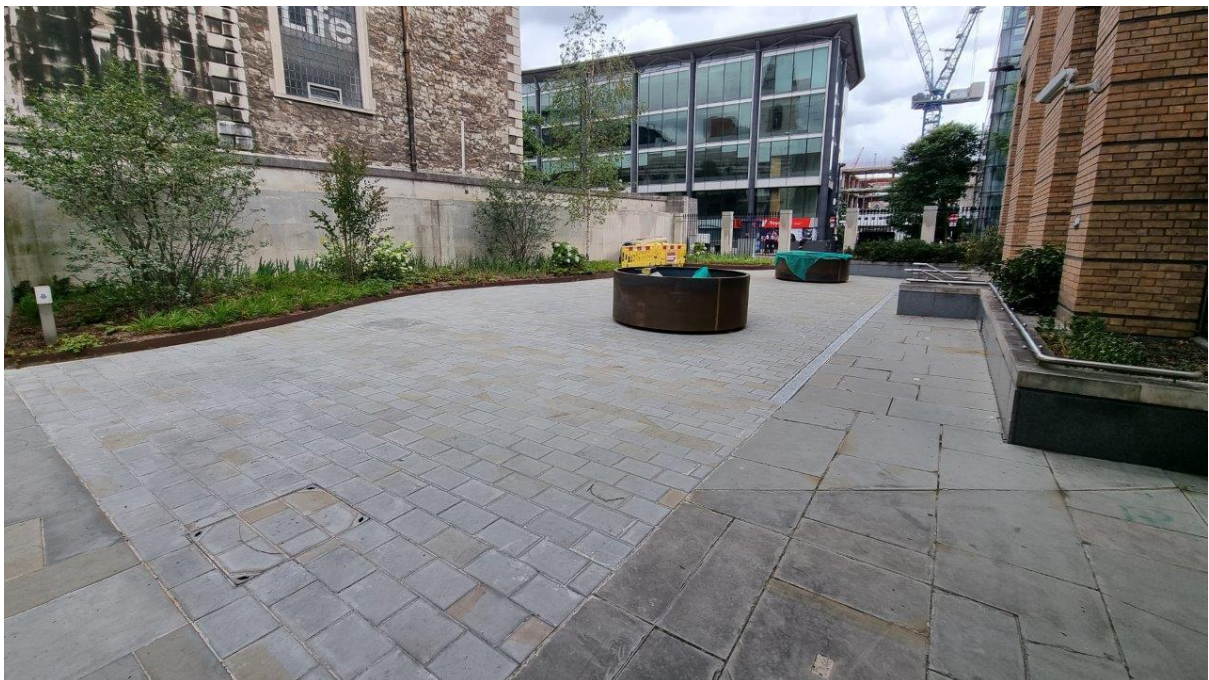
Phase 2 | Planters delivered, awaiting final planting schedule and street furniture | After