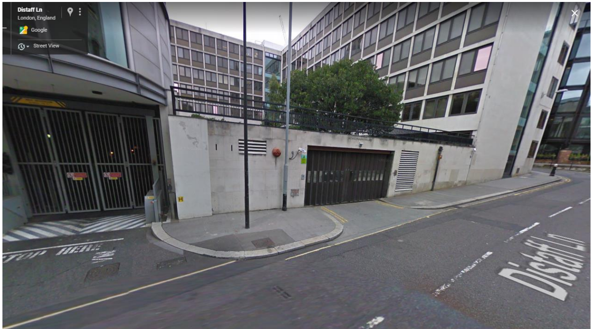
On-site Garden site and mastic asphalt footways | Before