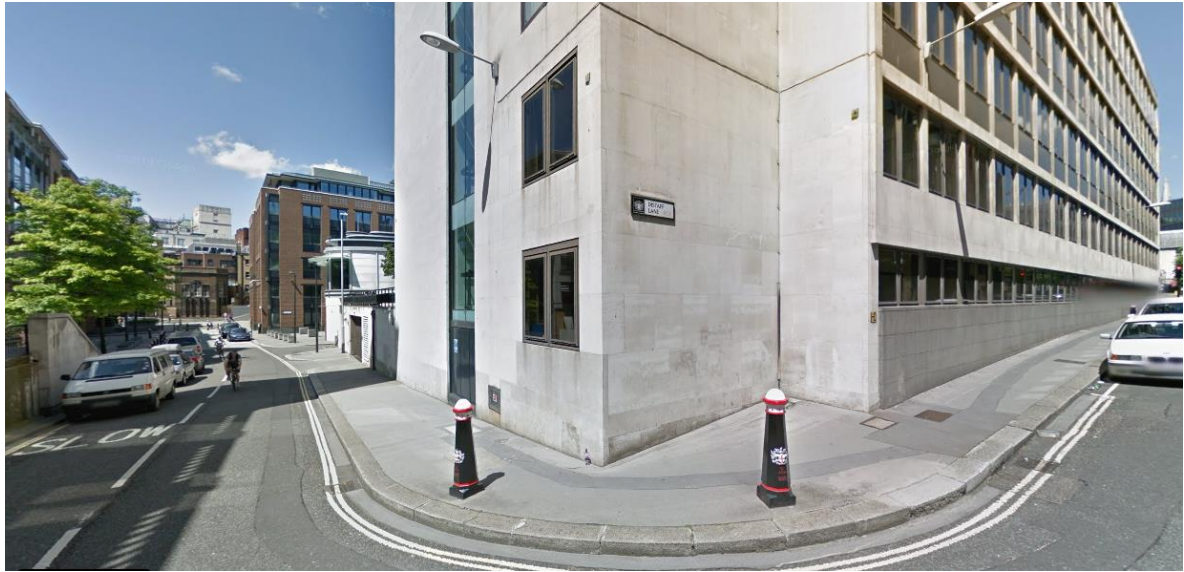
Phase 1: Distaff Lane footway around 2-6 Cannon Street development | Before