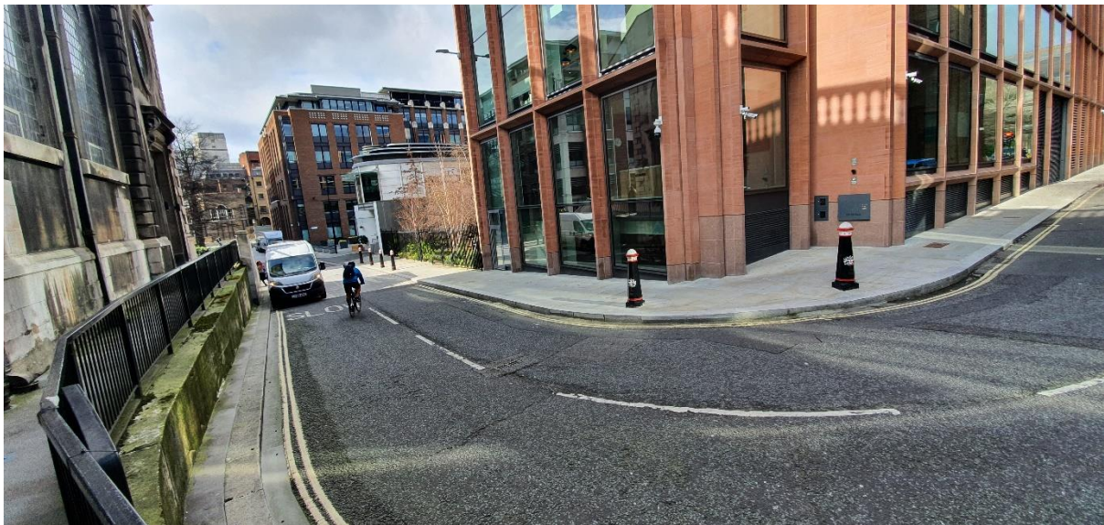
Distaff Lane footway around 2-6 Cannon Street development | Completed