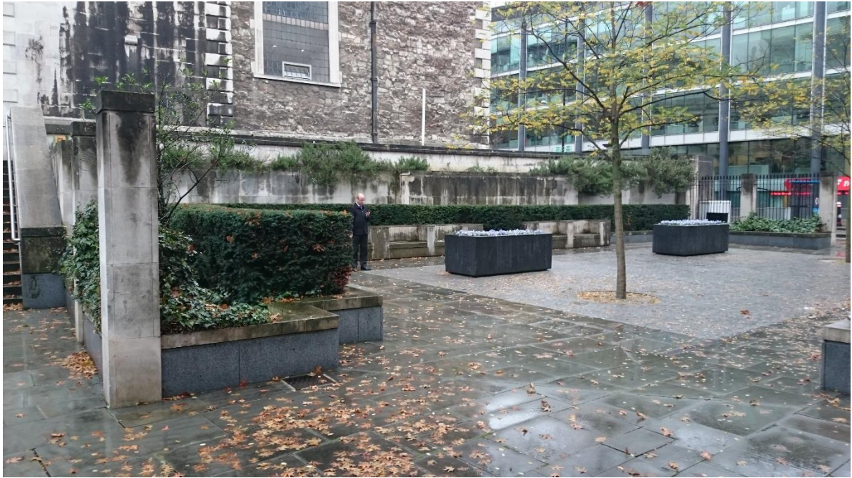
Phase 2 | Site of new Off-Site Garden | Before